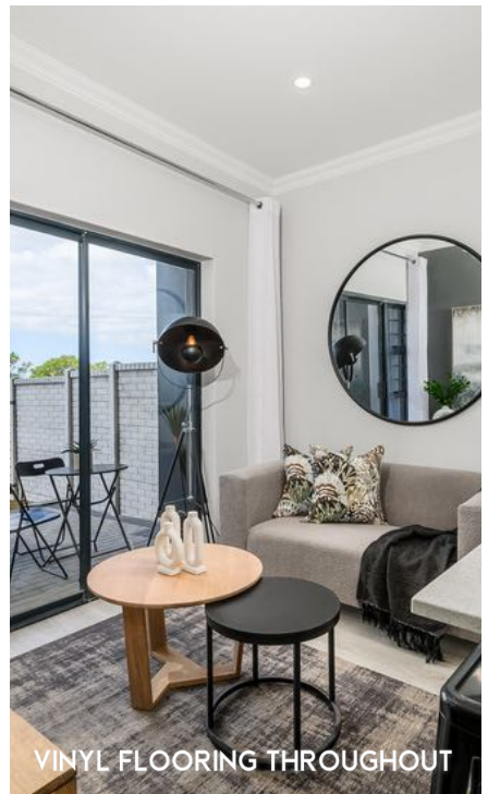
VINYL FLOORING THROUGHOUT