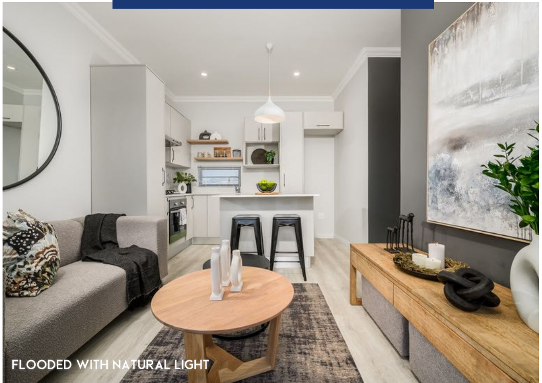
FLOODED WITH NATURAL LIGHT