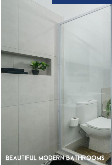
BEAUTIFUL MODERN BATHROOMS