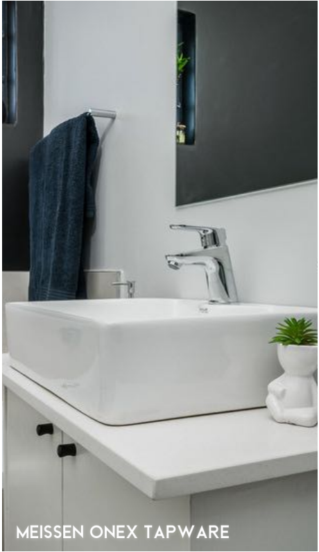
MEISSEN ONEX TAPWARE