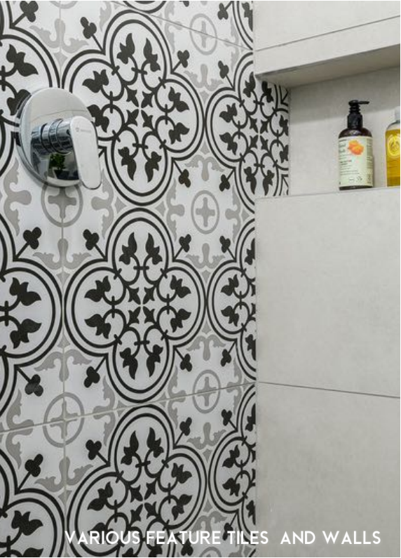
VARIOUS FEATURE TILES AND WALLS