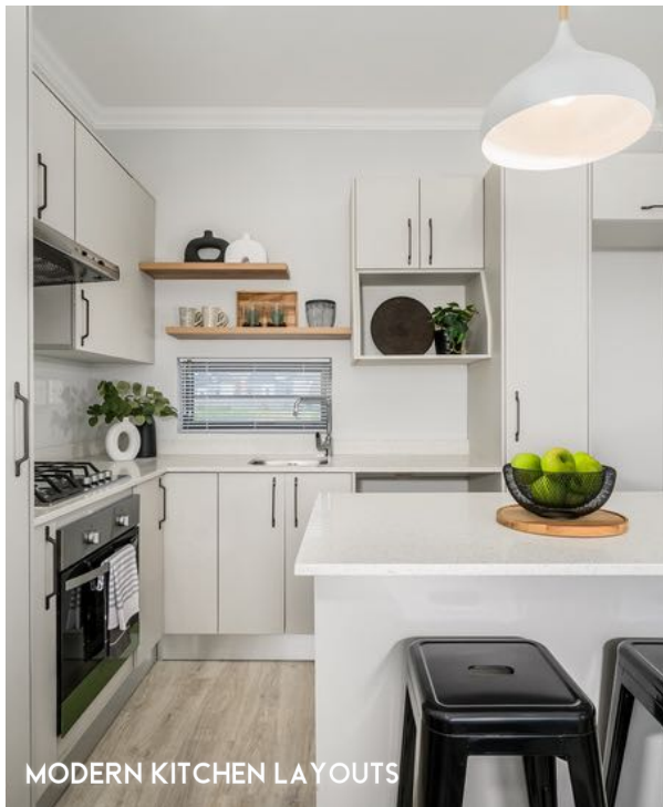
MODERN KITCHEN LAYOUTS